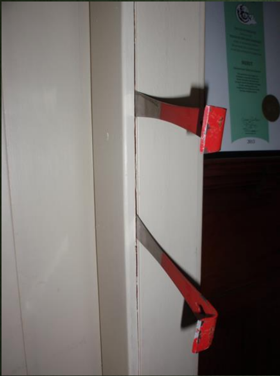
4) Gently open the gap