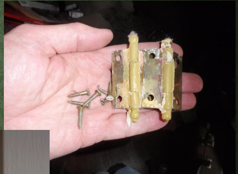
Brass hinges from medicine cabinet

Steel hinges with original tiger-stripe patina under multiple layers of white paint