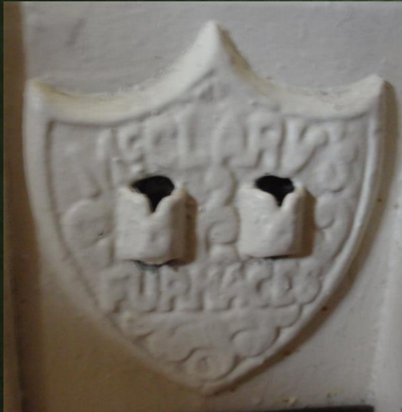
Furnace damper control

Tip #1: Stripping paint from metal hardware